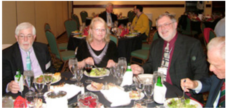
A lovely dinner with friends and colleagues...