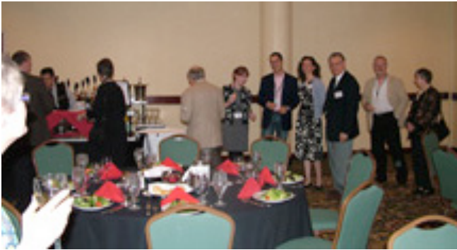
ONE bartender?! What were they thinking?!!