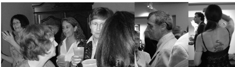
Photos opposite and below from the Princeton meeting, 2007