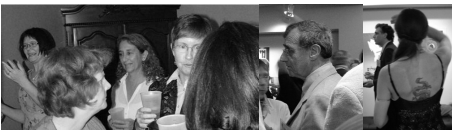
Photos opposite and below from the Princeton meeting, 2007