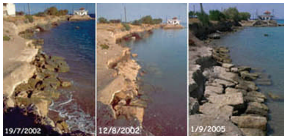
Deterioration of the (supposedly) "sane" part of the monument. (The dates refer to the day the picture was taken)

The photos at right were taken over the last three years illustrate the alarming erosion taking place at Diolkos, for further information, contact Sofia Loverdou at: sofia-l@tellas.gr