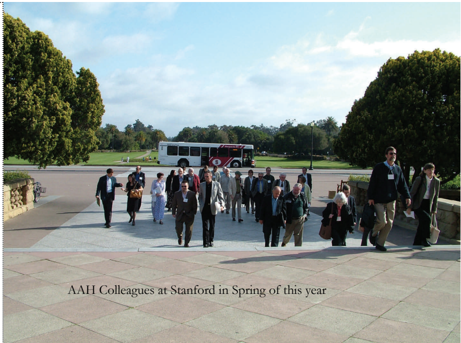
AAH Colleagues at Stanford in Spring of this year